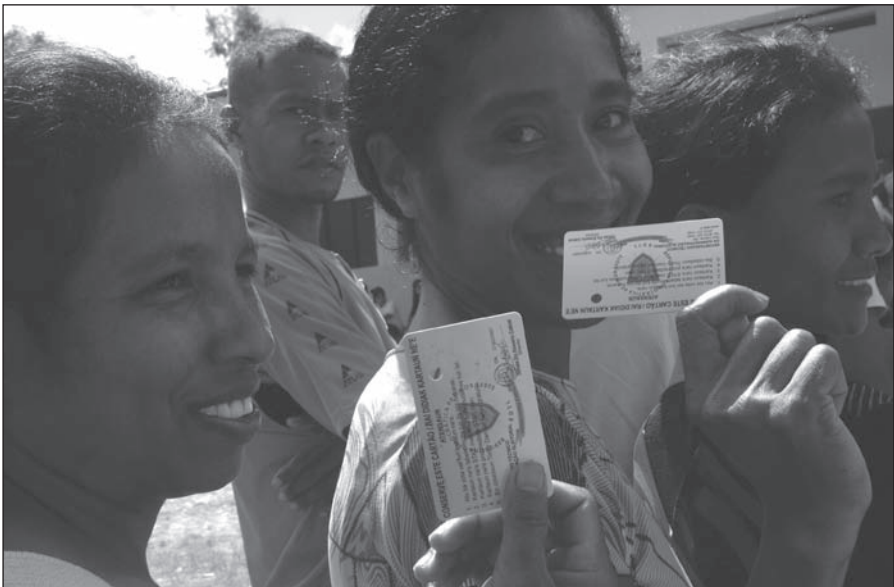
▲ Women showing their cards during the 2007 presidential election run off in Timor-Leste.

When a state cannot rely on a pre-existing list of voters, it generally performs a fresh registration exercise that requires eligible citizens to visit registration sites before the election. Registration, however, may easily become a source of inequality. In addition, women are negatively affected by the lack of adequate information campaigns, the location of registration sites, the need to possess valid identity documents, and literacy requirements.