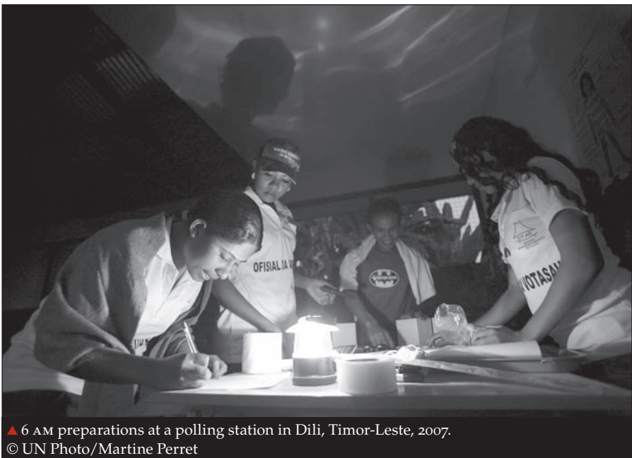
▲ 6 AM preparations at a polling station in Dili, Timor-Leste, 2007.

EMBs can play a key role in highlighting gender issues in elections by identifying obstacles that hinder the participation of women, and by