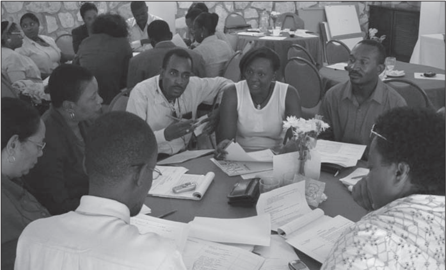
▲ Workshop examines women's participation in the Haitian's electoral process, Port-au-Prince, 2007.

In producing these guidelines, DPKO/DFS and DPA hope to provide field practitioners with a tool to facilitate the coordination of efforts and the building of capacity among national actors to help ensure that women's participation becomes an integral part of all future electoral processes. DPKO/DFS and DPA however, cannot create opportunities for women's involvement in economic empowerment programmes or generate employment for women, nor can they provide financial support, directly or indirectly, to a political party or candidate. ■