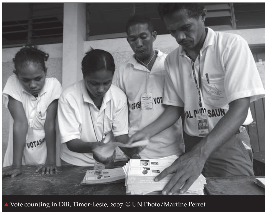
▲ Vote counting in Dili, Timor-Leste, 2007.

While international observation guidelines 20 recognise the importance of gender diversity in election observation missions, not all organisations are required to respect such a balance. Frequently, claims are made that the number of trained women is insufficient, or that, in some contexts, the security situation precludes the participation of women.