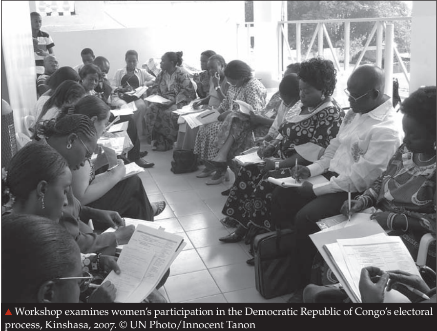
▲ Workshop examines women's participation in the Democratic Republic of Congo's electoral process, Kinshasa, 2007.

The guidelines assume that the UN is assisting a government in running an election. In such a case, the UN will encourage the government to take action that will have a positive impact on women's participation in the elec-