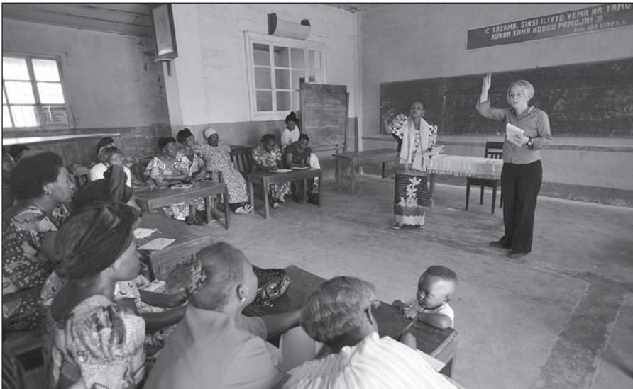
▲ Educating the women electorate of Mongwalu before the 2006 election in the Democratic Republic of Congo.

Civic and voter education campaigns aimed at women and men are necessary for successful elections. In the most traditional areas, it is common for women to be segregated from men and to have different levels of freedom of movement. Furthermore, girls' access to education in post-conflict countries is more limited than that of boys. Many girls leave school because of increasing responsibilities towards elderly and sick members of their families, early marriage and pregnancy, or the pressing need to engage in menial tasks or to work for small-scale enterprises to make ends meet. As a result, levels of illiteracy are extremely high among women. This affects the ability of public information materials and outreach campaigns, for example, to address the needs of women in an effective way. It is important therefore that voter education teams: include women (if necessary comprising only women); present a message that women of all levels of education and the illiterate can understand; and deliver the message at appropriate, accessible venues. While men can travel freely to a distant location to attend an electoral workshop, women may not enjoy the same access to transportation, they may not have the freedom to travel at night, they may fear becoming the object of gender-based violence, or traditional practices may prevent them from leaving their homes.