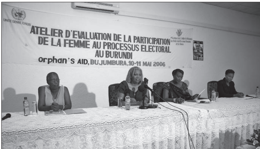
▲ Workshop examines women's participation in Burundi's electoral process, Bujumbura, 2006.

In some instances, though, post-conflict environments that lack entrenched party structures are characterised by a prevalence of independent candidates. This can be advantageous for women, as they can avoid the patriarchal and ethnic holders of power in traditional societies—where tribal support is a necessary criterion for candidate nomination within a party. Nevertheless, running as an independent candidate can also be problematic, owing to a lack of party support, especially funds for campaigning.