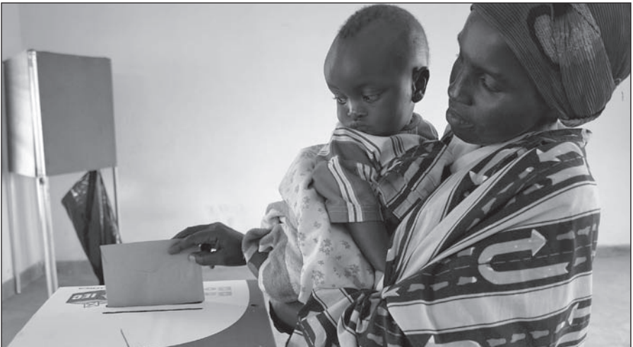
▲ A woman from Macamba Province, Burundi, voting in the 2005 national referendum.

Article 31.2 of the Rules and Procedures governing polling and counting in Timor-Leste's 2007 presidential election stipulates that priority should be given to pregnant women and women with babies, as well as to sick, challenged and elderly persons in polling lines. The move, stemming from practices adopted during previous UN-administered elections, was formalised in the Rules and Procedures for the parliamentary elections on the recommendation of the Legal Adviser to UNMIT's Electoral Affairs Section, and was widely upheld during the 2007 electoral cycle. Reference to the stipulation was made in the training manual for polling staff. In a country where the fertility rate is among the highest in the world (with women having on average 7.7 children), the priority accorded to pregnant women and women with babies facilitated voting by a large portion of Timorese women. ■